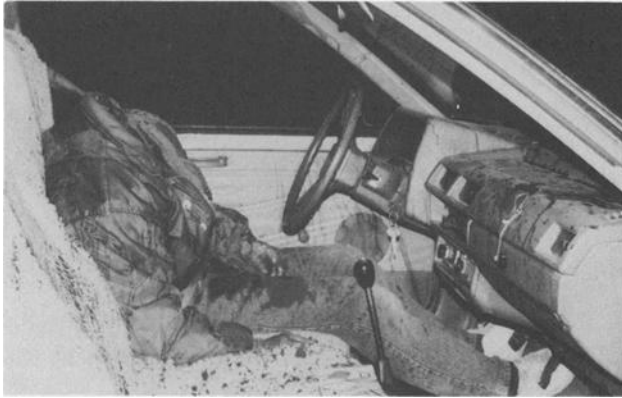
FIG. 2 — The torso as found at the scene.